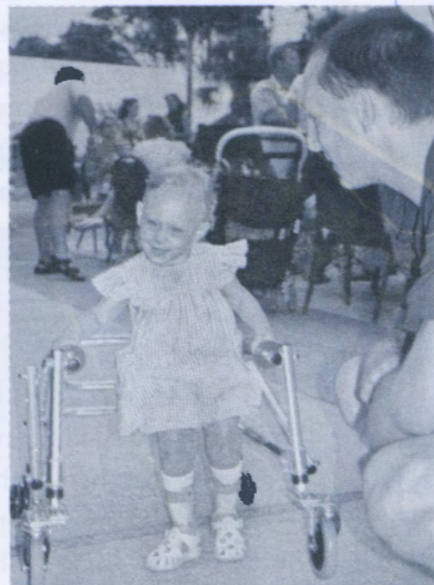
Left: Each year parents and children from throughout Georgia attend the Babies Can Wait Parent Conference on Early Intervention that is coordinated by IHDD.