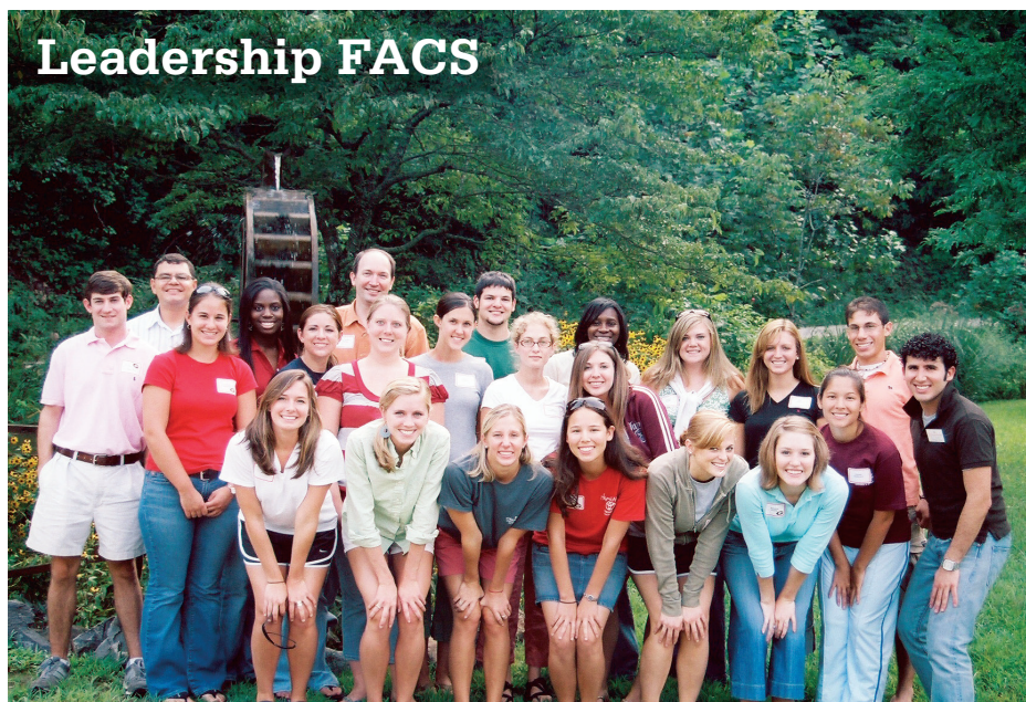
Leadership FACS Twenty-one College Ambassadors, club presidents and Legislative Aides joined faculty and staff for two days of leadership training at Camp Wahsega in Dahlonega.