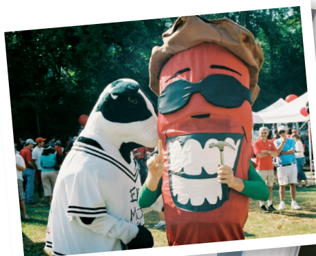
South Campus Tailgate 2006

Breaking News ..... 2 Honor Roll of Donors ..... 11 FACS Facts ..... 15 In Memoriam ..... 21 In The Halls ..... 22 New Faculty..... 24