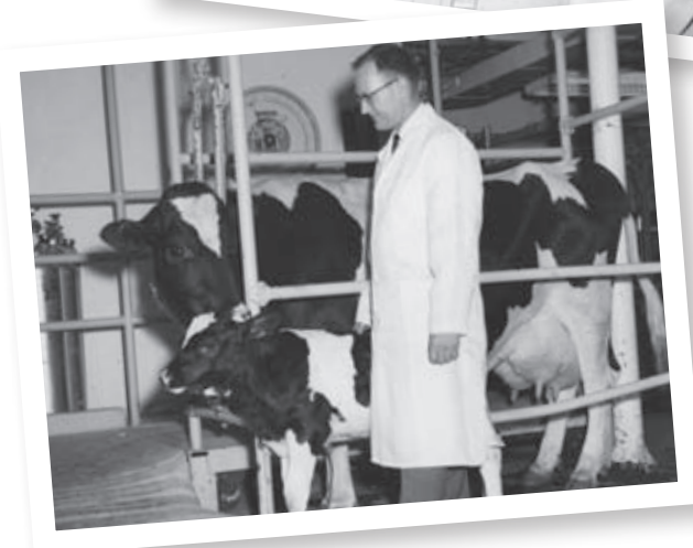
▲ USDA Lab, Beltsville, Maryland