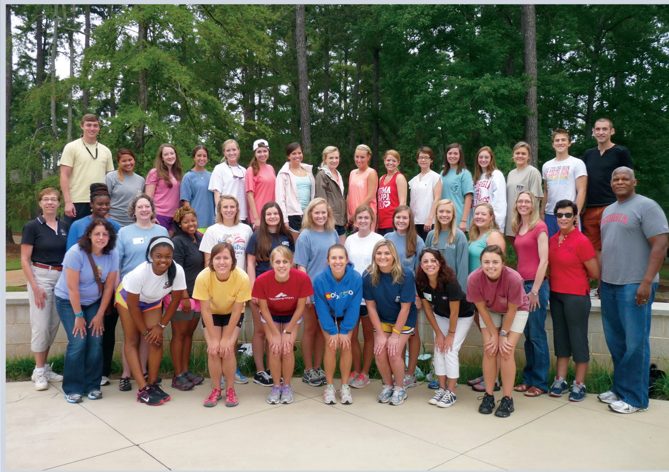
The 20 th anniversary of Leadership FACS was held in August at Rock Eagle 4-H Center with 31 student leaders participating.