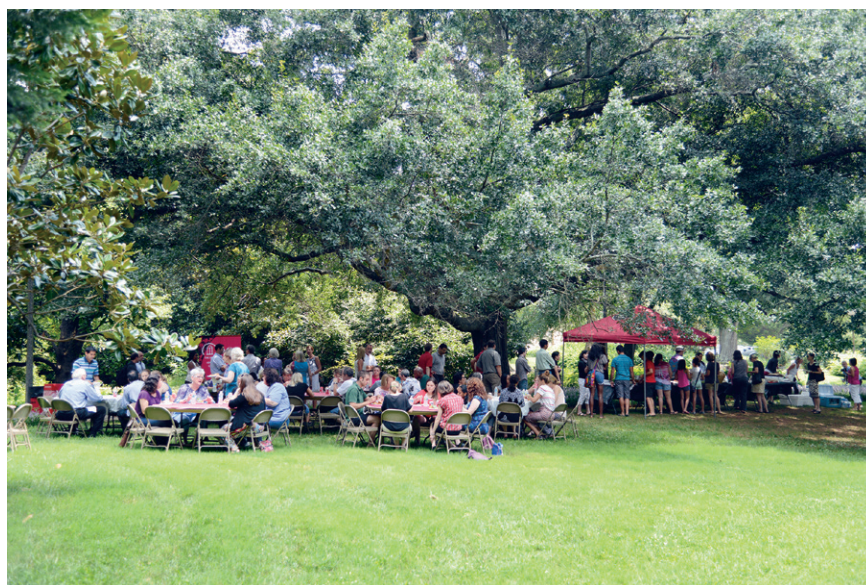
More than 120 faculty, staff and graduate students attended FACS' first Welcome Back to School Picnic behind Dawson Hall in August.